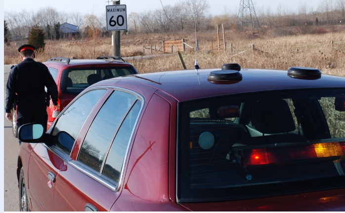
Halton Regional Police Service officers routinely patrol North Halton roadways to ensure public safety.

With urban expansion taking place in the south end of Halton Region and to the east in Peel Region, our area has become a haven for outdoor cycling enthusiasts eager to test themselves with long-distance riding. Cycling routes stretch from the lakeshore to the top end of Halton Hills. It has scenic lengths of urban and rural roads coupled with challenging routes through escarpment bluffs and ravines.